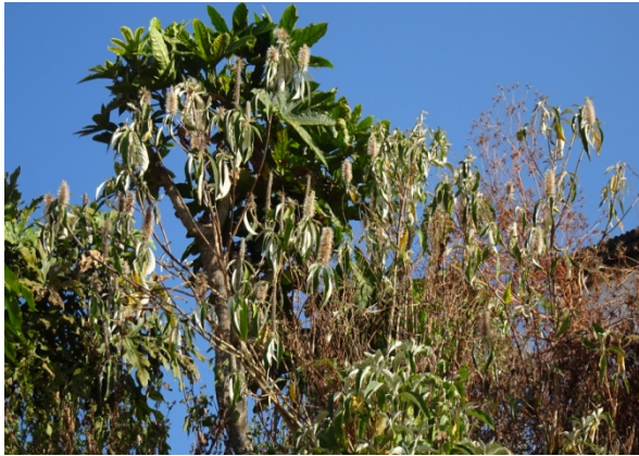
Leucoscepterum canum (Kawihthuang)