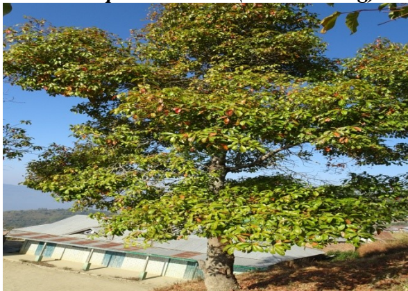
Schima wallichii (Khiang)