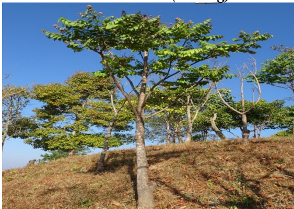
Toona ciliata (Tei)