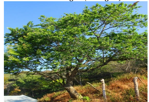
Prunus cerasoides (Tlaizawng)