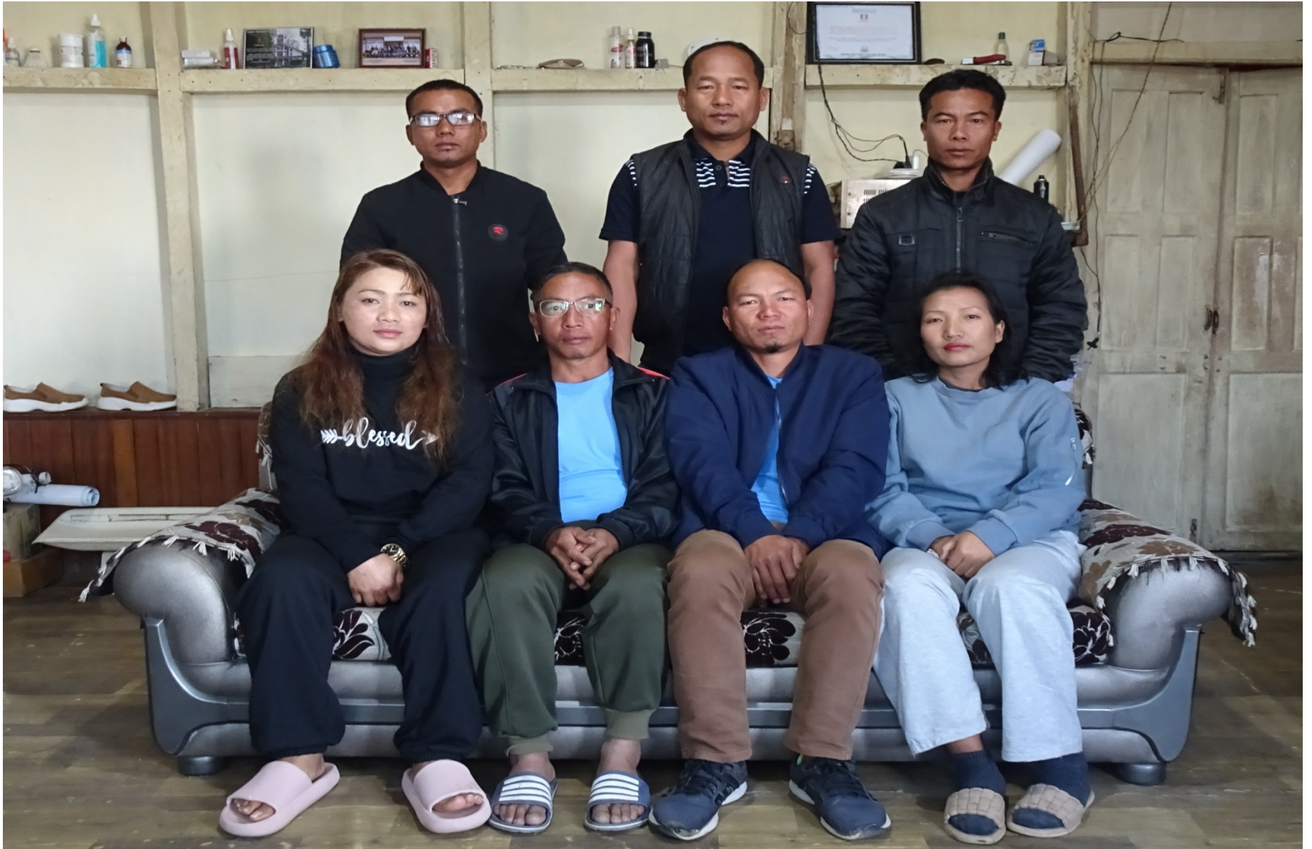
Biodiversity Management Committee Members, Vangchhia