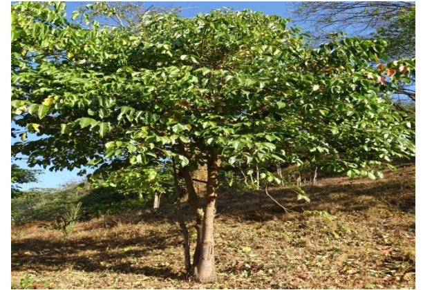
Bischofia javanica (Khuangthli)