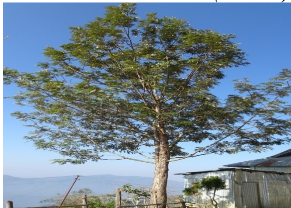
Grevillea robusta (Silver Oak)