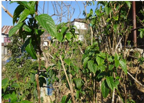
Clerodendrum colebrookianum (Phuihnam)