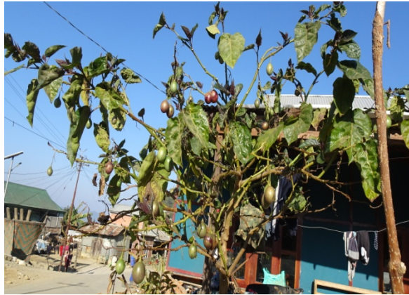
Cyphomandra betacea (Thing be-ra/tomato)