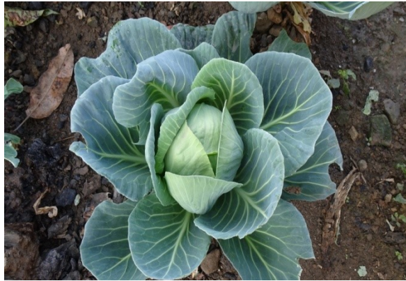
Brassica oleracea var capitata