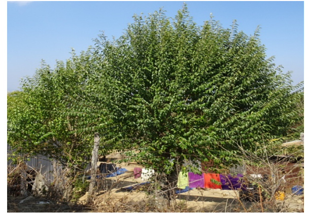
Ligustrum robustum (Chawmzil)