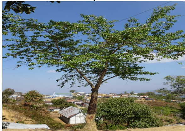
Prunus cerasoides (Tlaizawng)