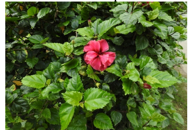
Hibiscus rosa sinensis