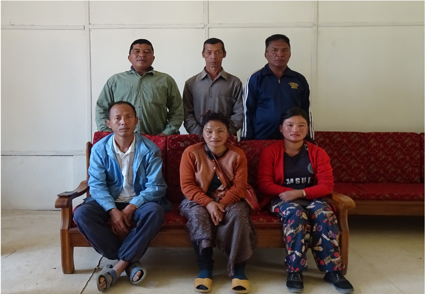
Biodiversity Management Committee Members Khuangphah