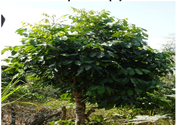
Dysoxylum excelsum (Thingthupui)