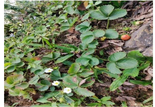
Fragaria x ananassa