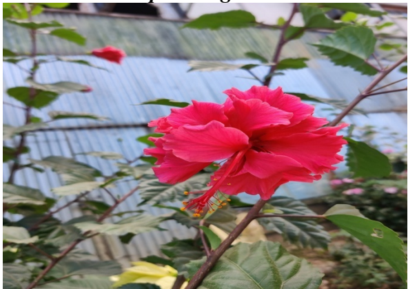
Hibiscus rosa sinensis