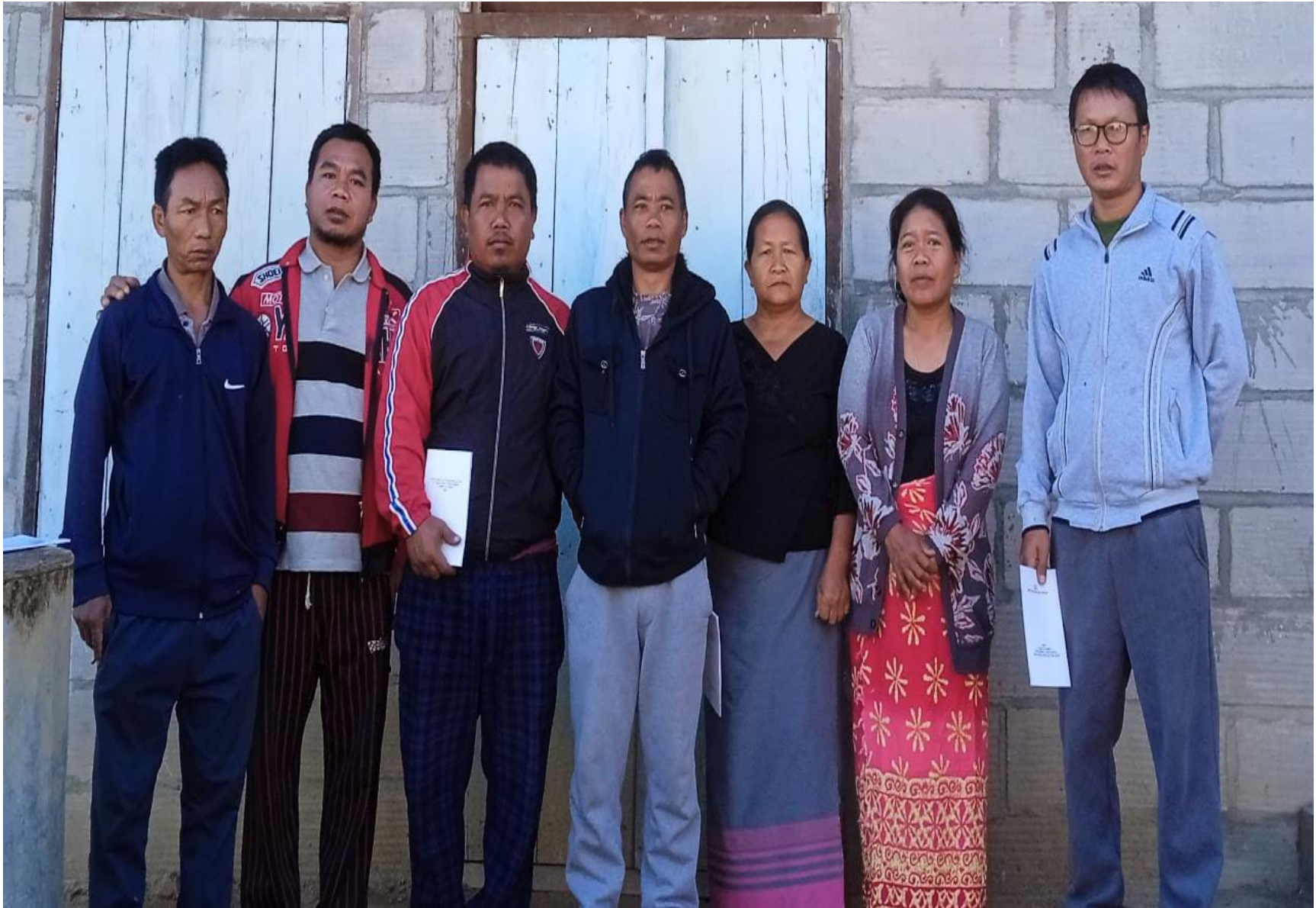
Members of Biodiversity Management committee, N.Mualcheng