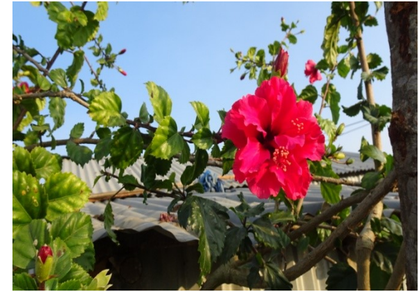
Hibiscus rosa sinensis