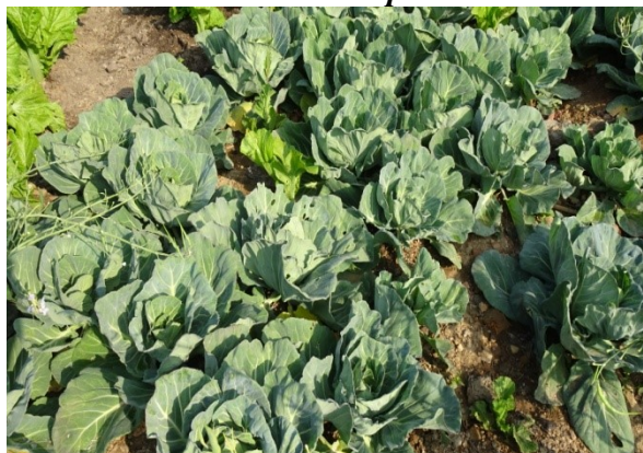
Brassica oleracea var. capitata