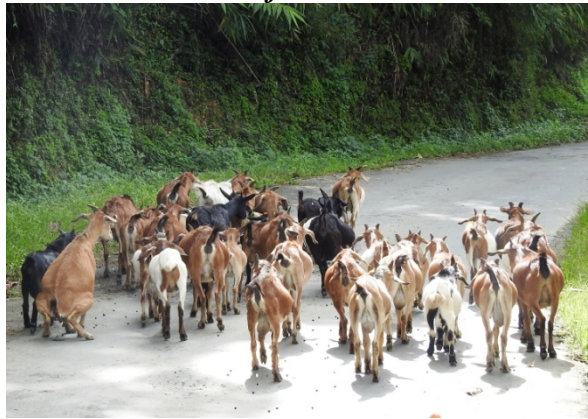
Capra aegagrus hircus