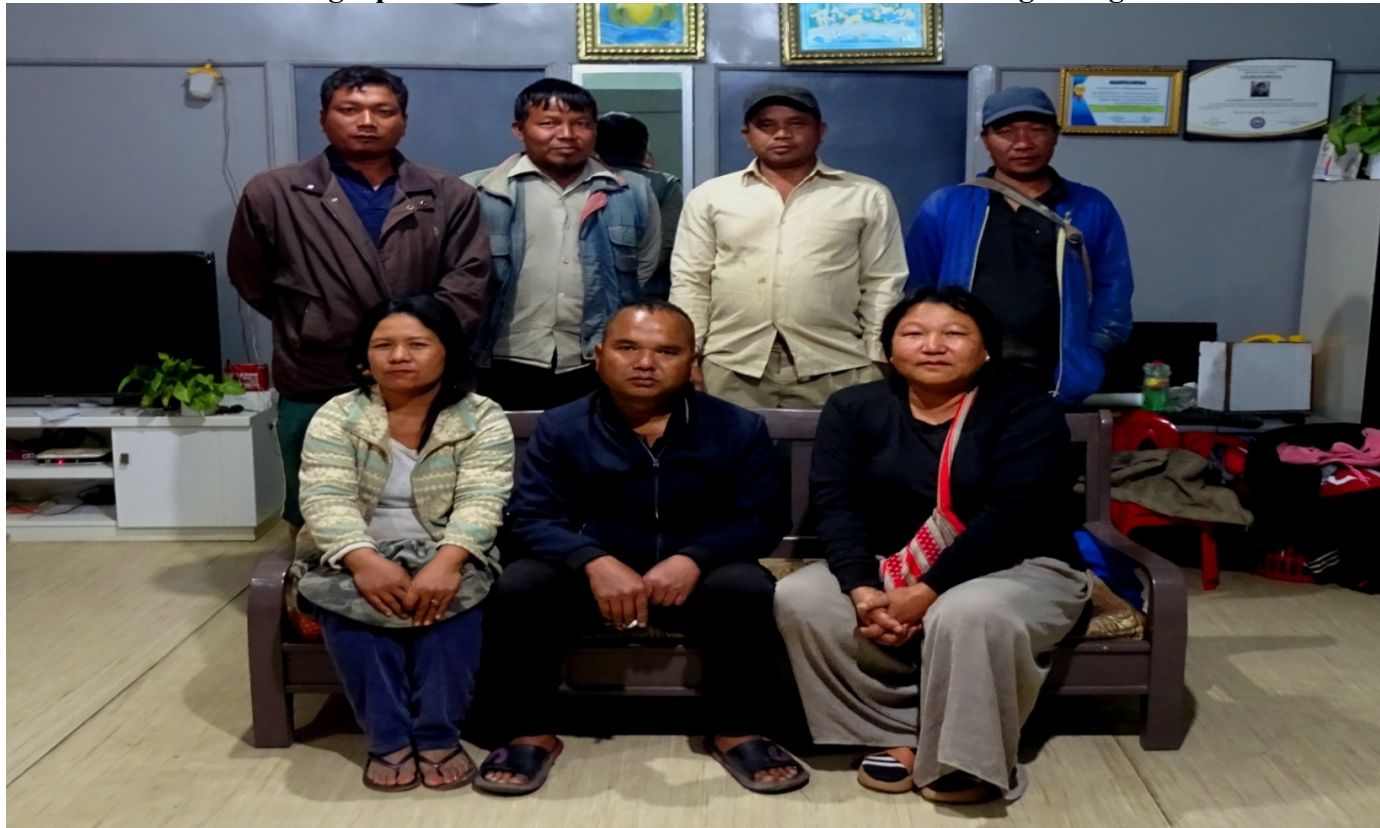
Members of Biodiversity Management Committee Kelkang