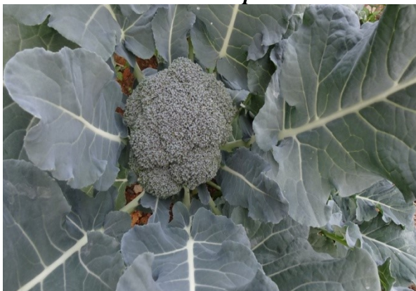
Brassica oleracea var. italica