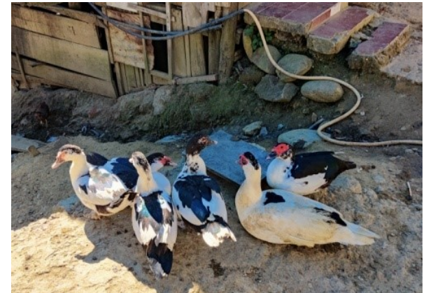
Anas platyrhynchos domesticus