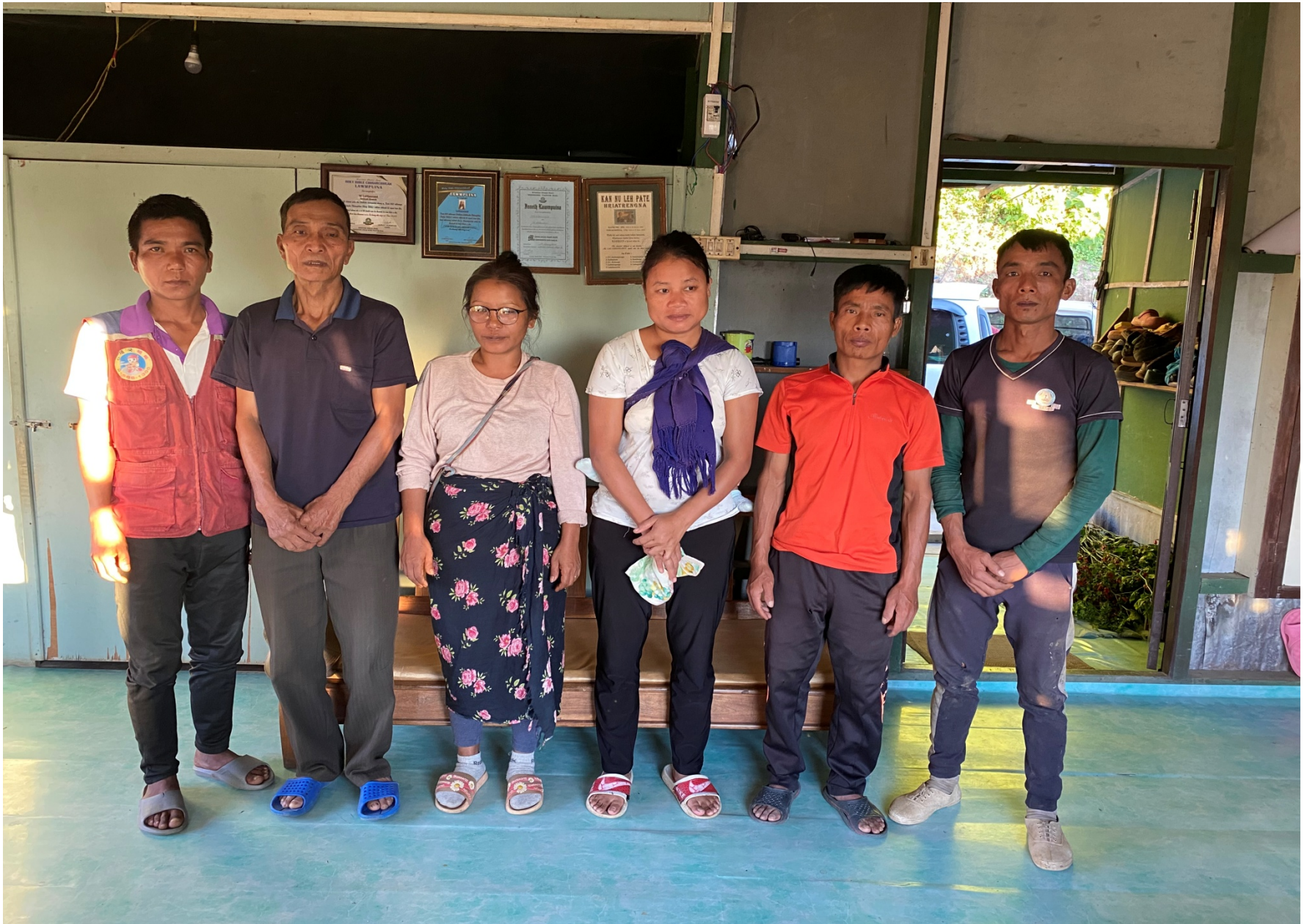
Members of Biodiversity Management Committee Neihloh