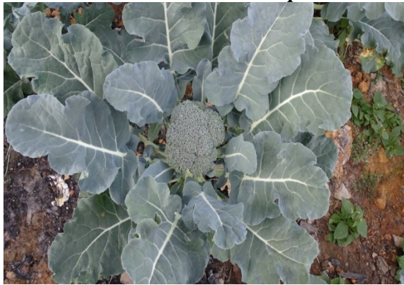
Brassica oleracea var. italica