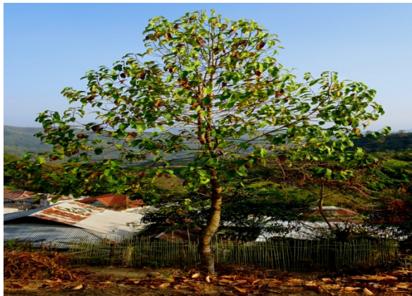
Michelia champaca (Ngiau)