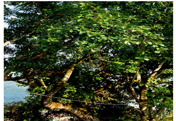
Carallia brachiata (Theiria)