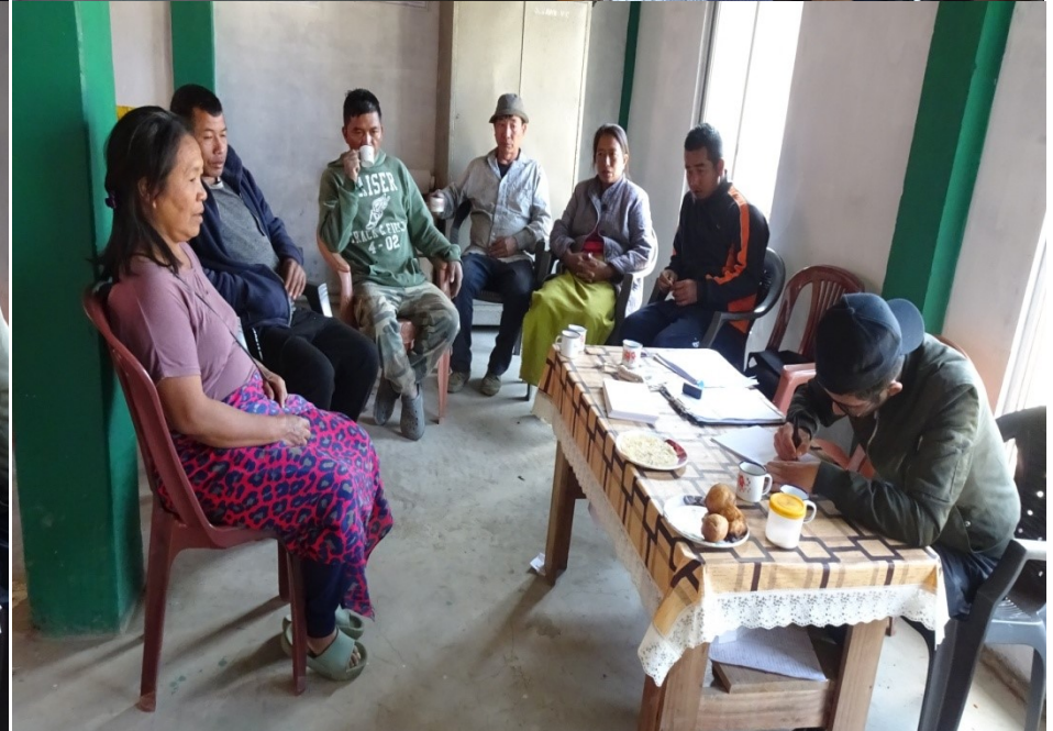
Derrick from SBB Mizoram and BMC members of Dilkawn - Collection of necessary data and information for PBR during Updation and Field Validation of PBR at Dilkawn Village