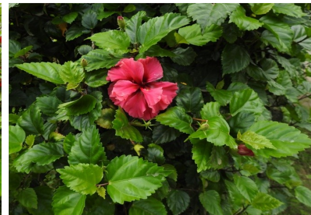
Hibiscus rosa sinensis