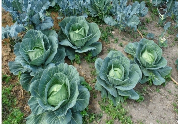
Brassica oleracea var. capitata