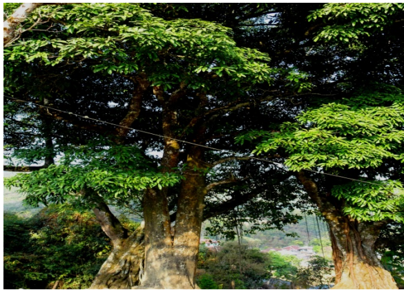
Mangifera indica (Theihai)