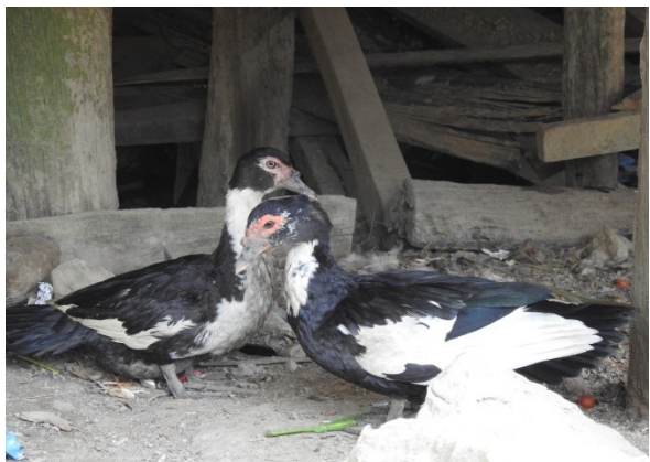
Anas platyrhynchos domesticus