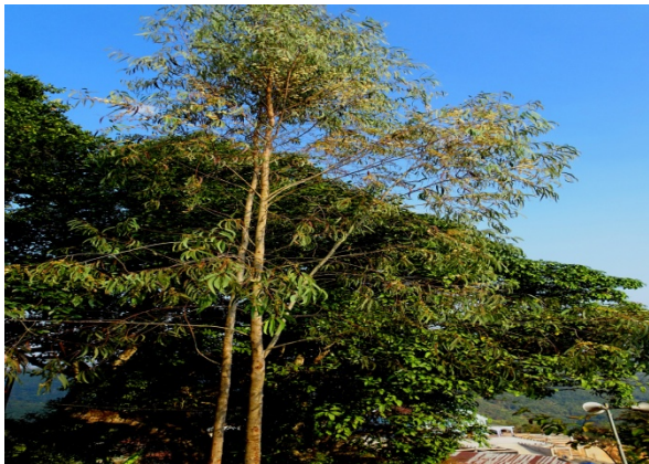
Eucalyptus (Nawalh thing)