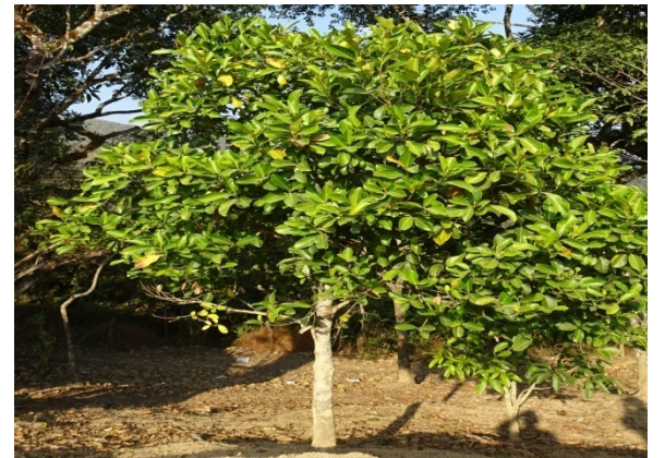
Artocarpus heterophylla (Lamkhuang)