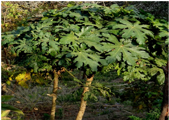
Trevesia palmata (Kawhtebel)