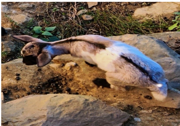
Capra aegagrus hircus