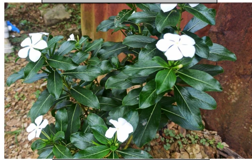
Catharanthus roseus (Kumtluang)