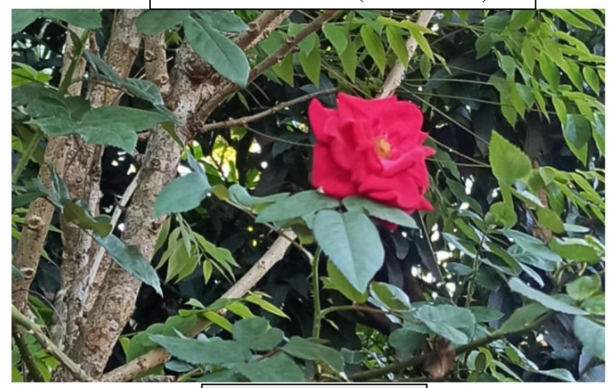
Rosa indica (Rose)