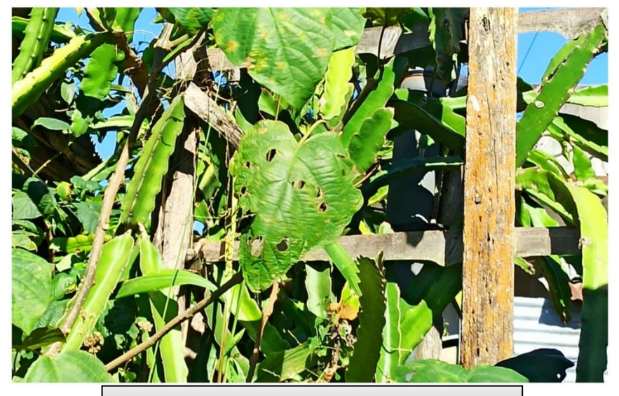
Hylocereus costaricensis (Dragon fruit)