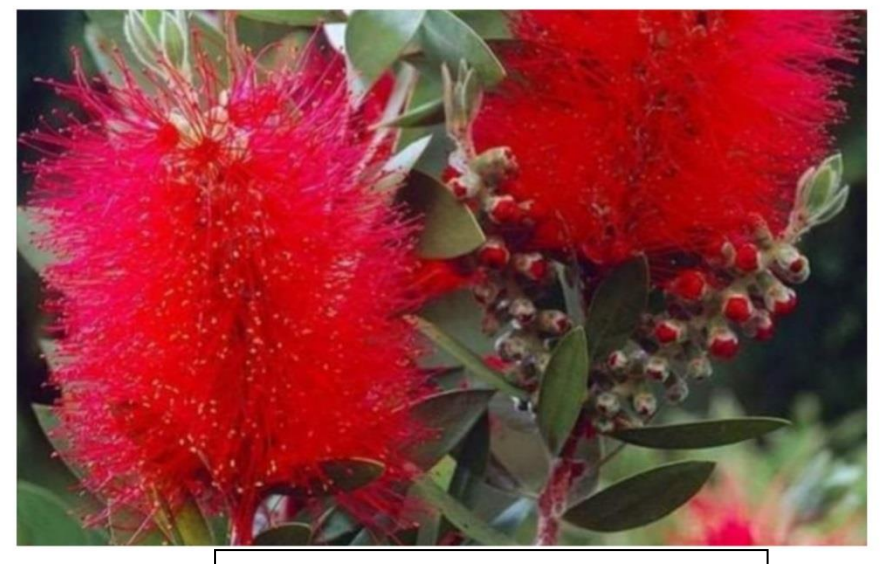
Callistemon citrinus (Bottle brush)