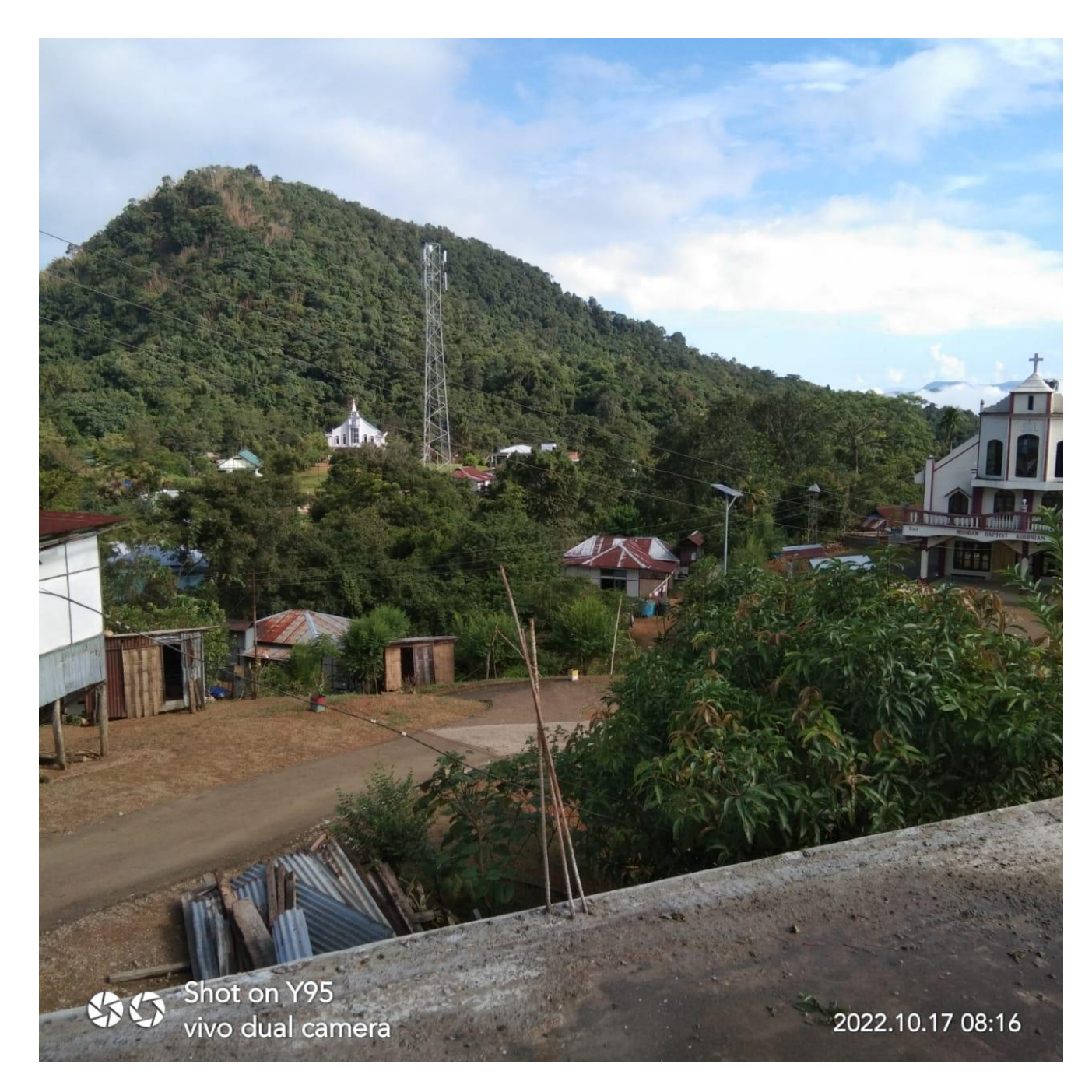
South Phaileng Village