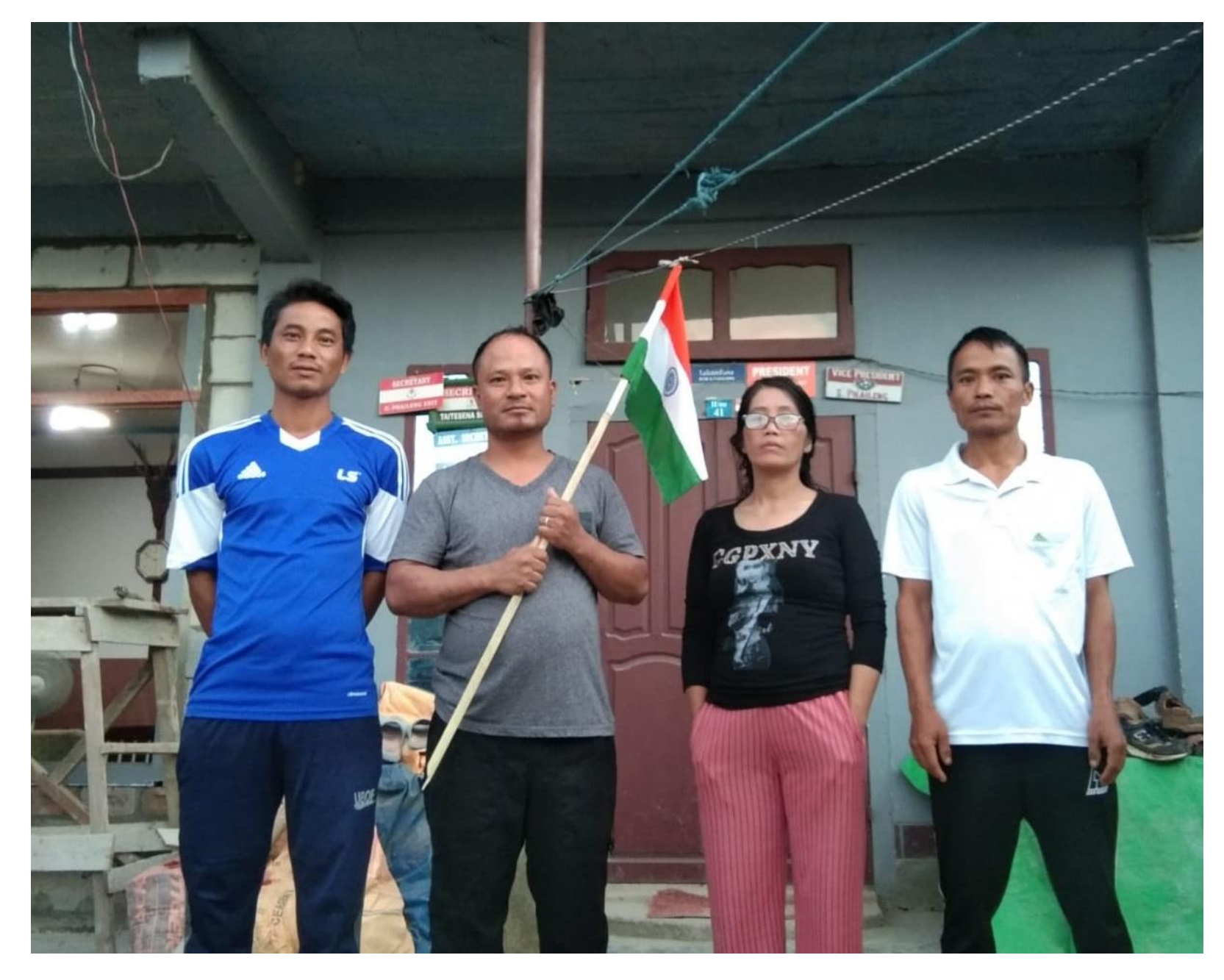
Biodiversity Management Committee: South Phaileng