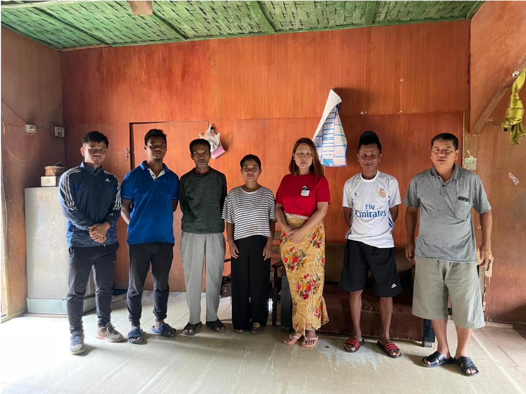
Members of Biodiversity Management Committee, Bungtlang ‘S’