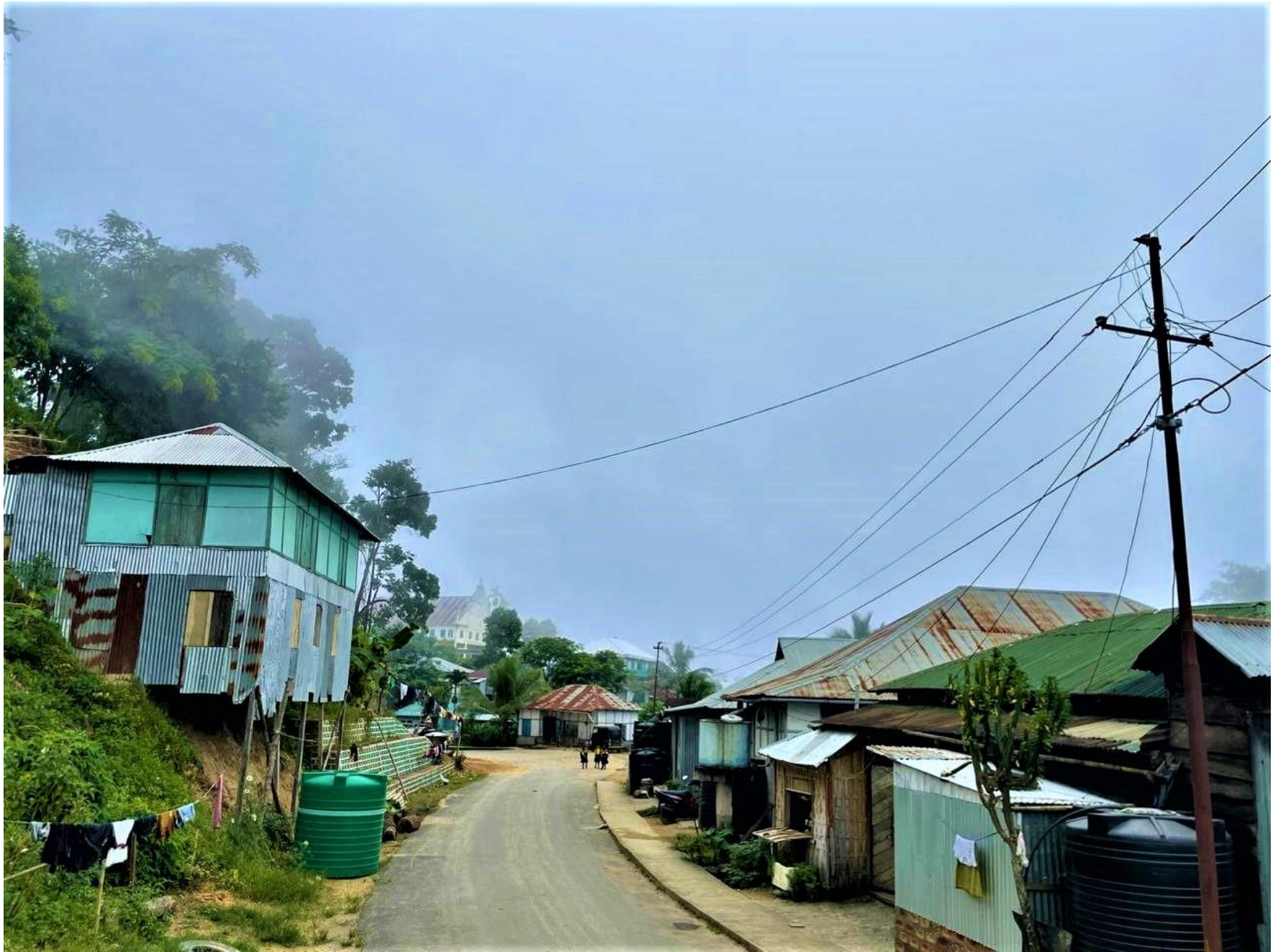
Village of Bunglang 'S'