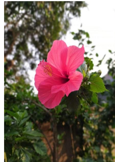
Hibiscus rosa sinensis