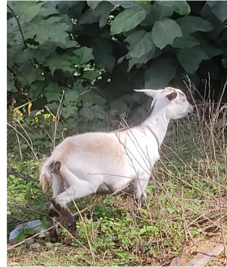
Capra aegagrus hircus