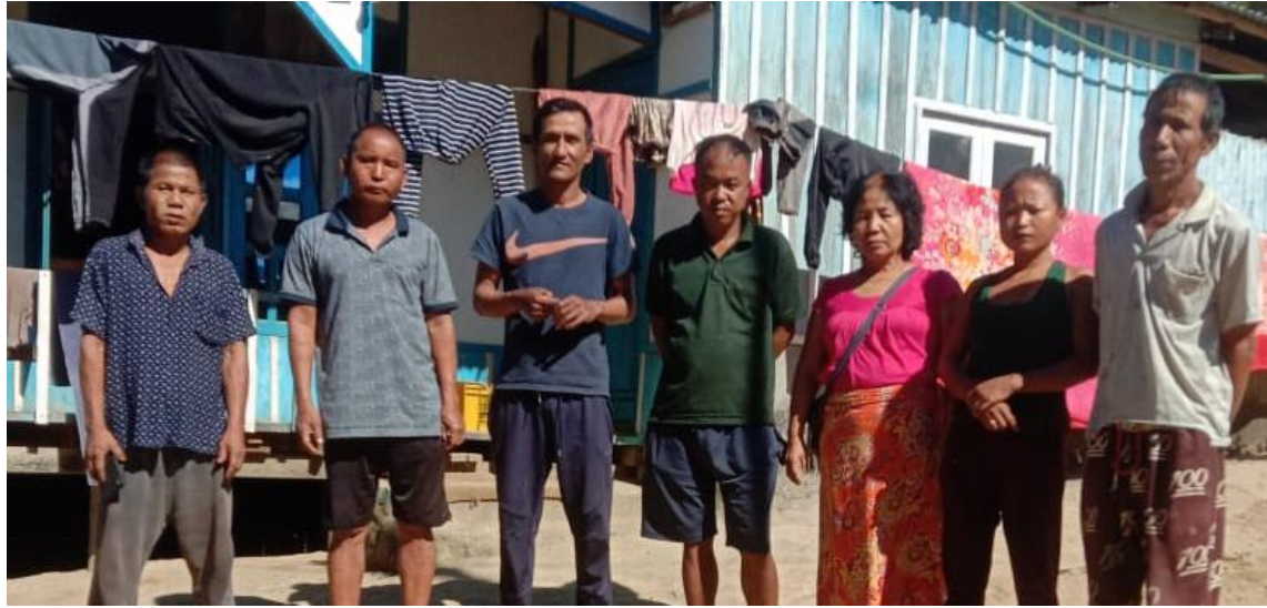
Members of Biodiversity Management Committee, Vartekkai