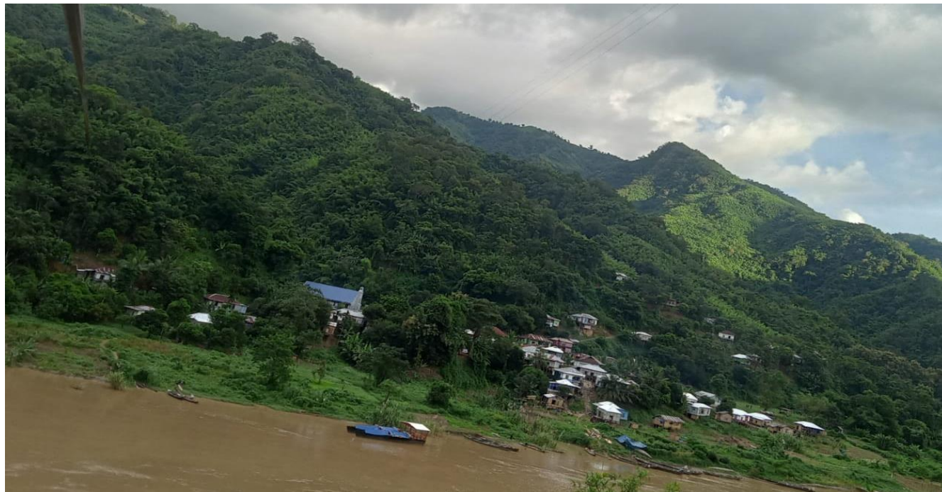
Village of Vartekkai