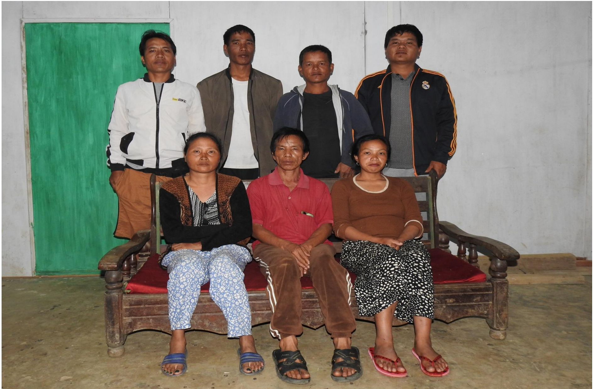
Members of Biodiversity Management Committee, Tualpui