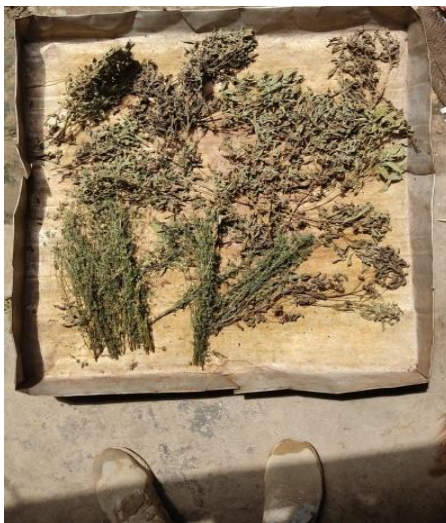
Elsholtzia communis & Trachyspermum roxburghianum dried for further use