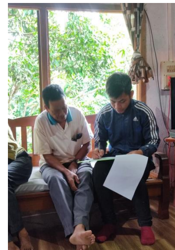
Meeting with BMC in Ngengpuitlang Village