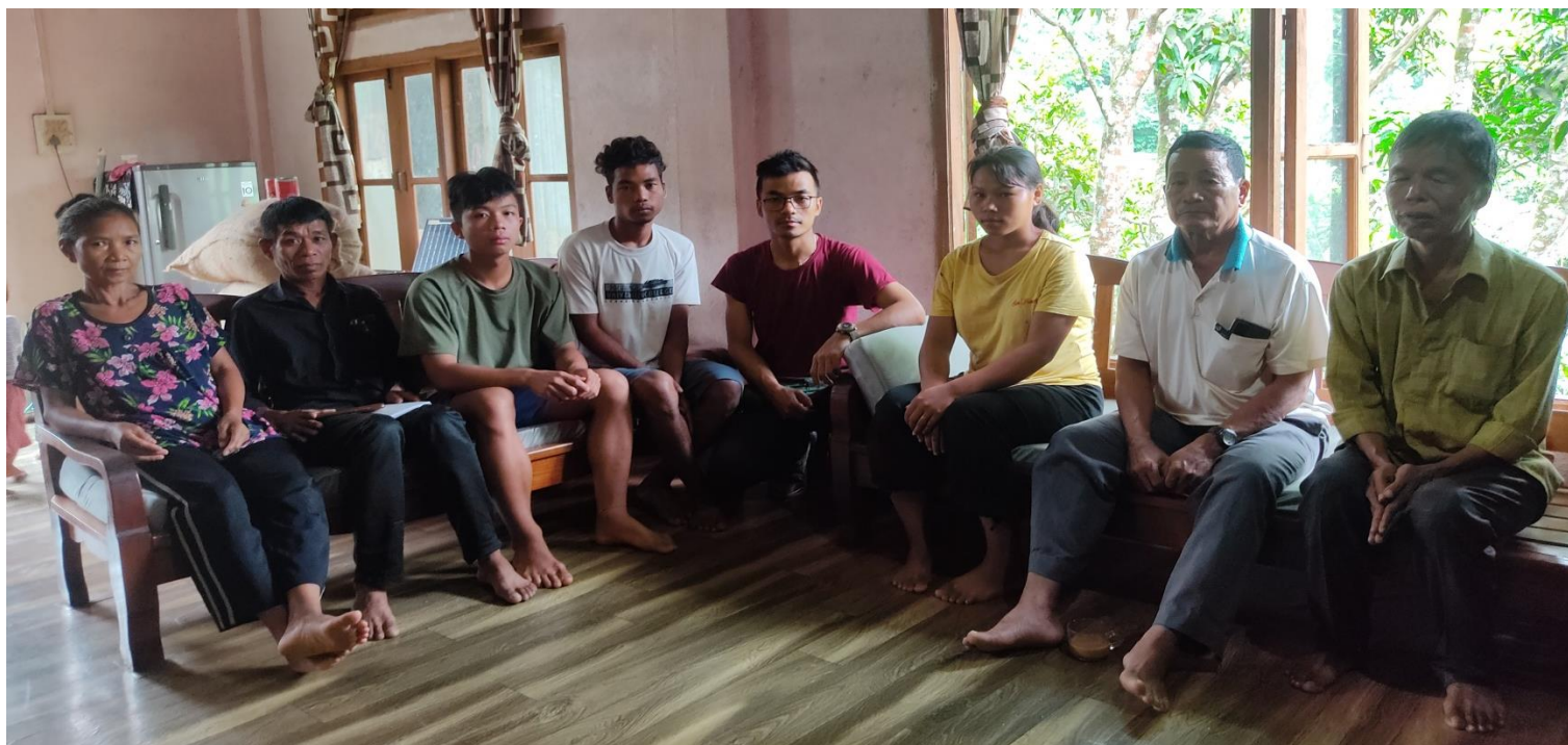
Members of Biodiversity Management Committee, Ngengpuitlang