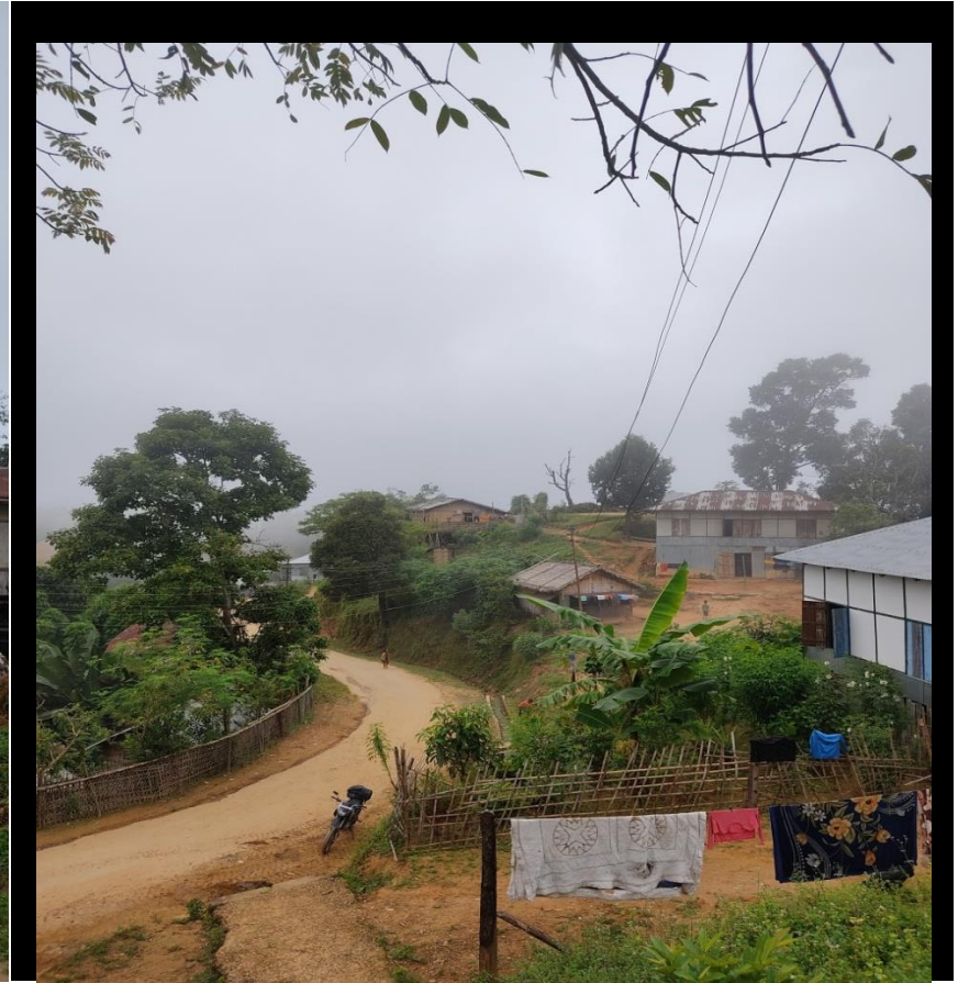
Village of Ngengpuitlang