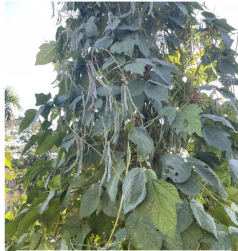
Vigna umbellata (Thunb.)