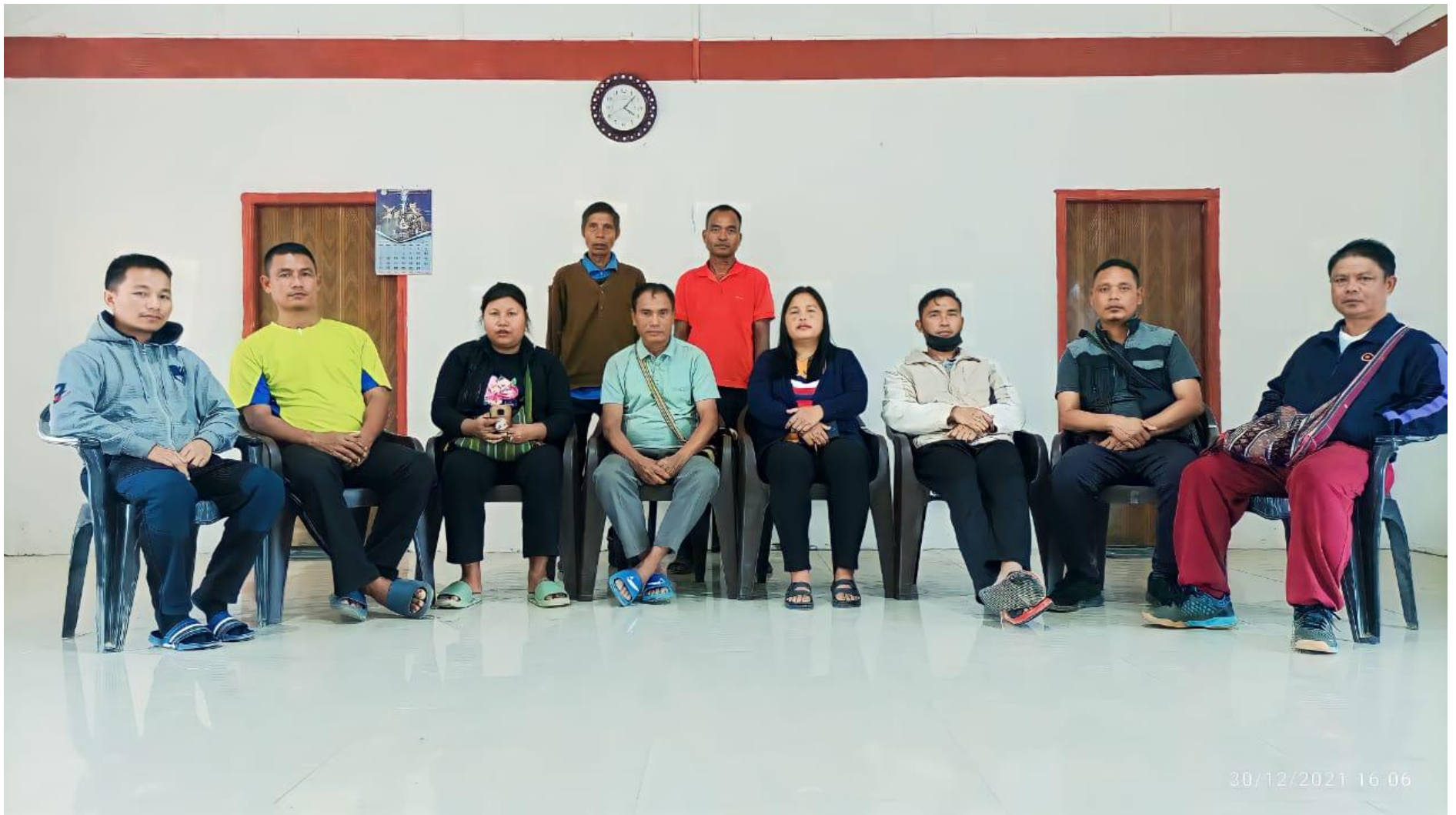
Members of Biodiversity Management Committee, Damparengpui