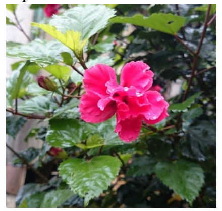
Hibiscus rosa sinensis