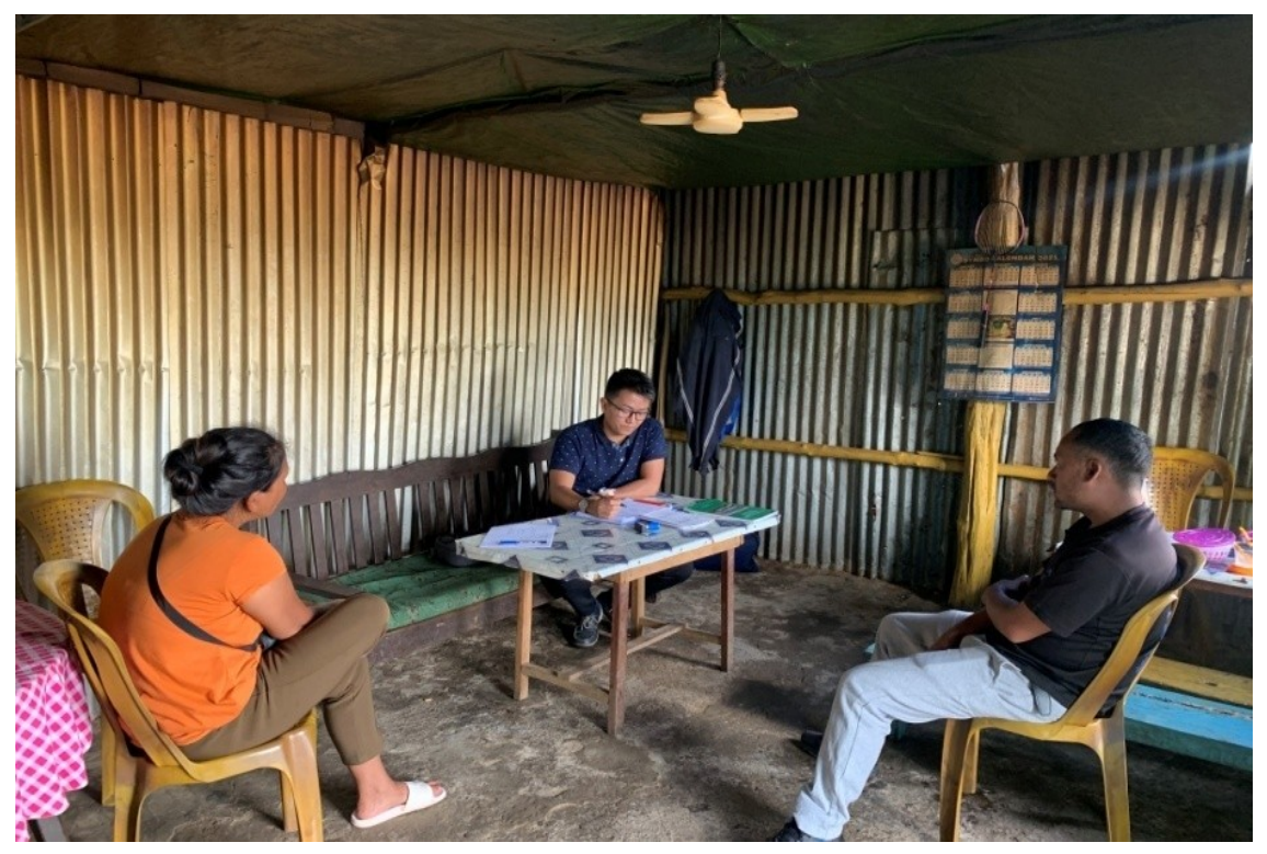
Meeting with BMC members & documentation of PBR