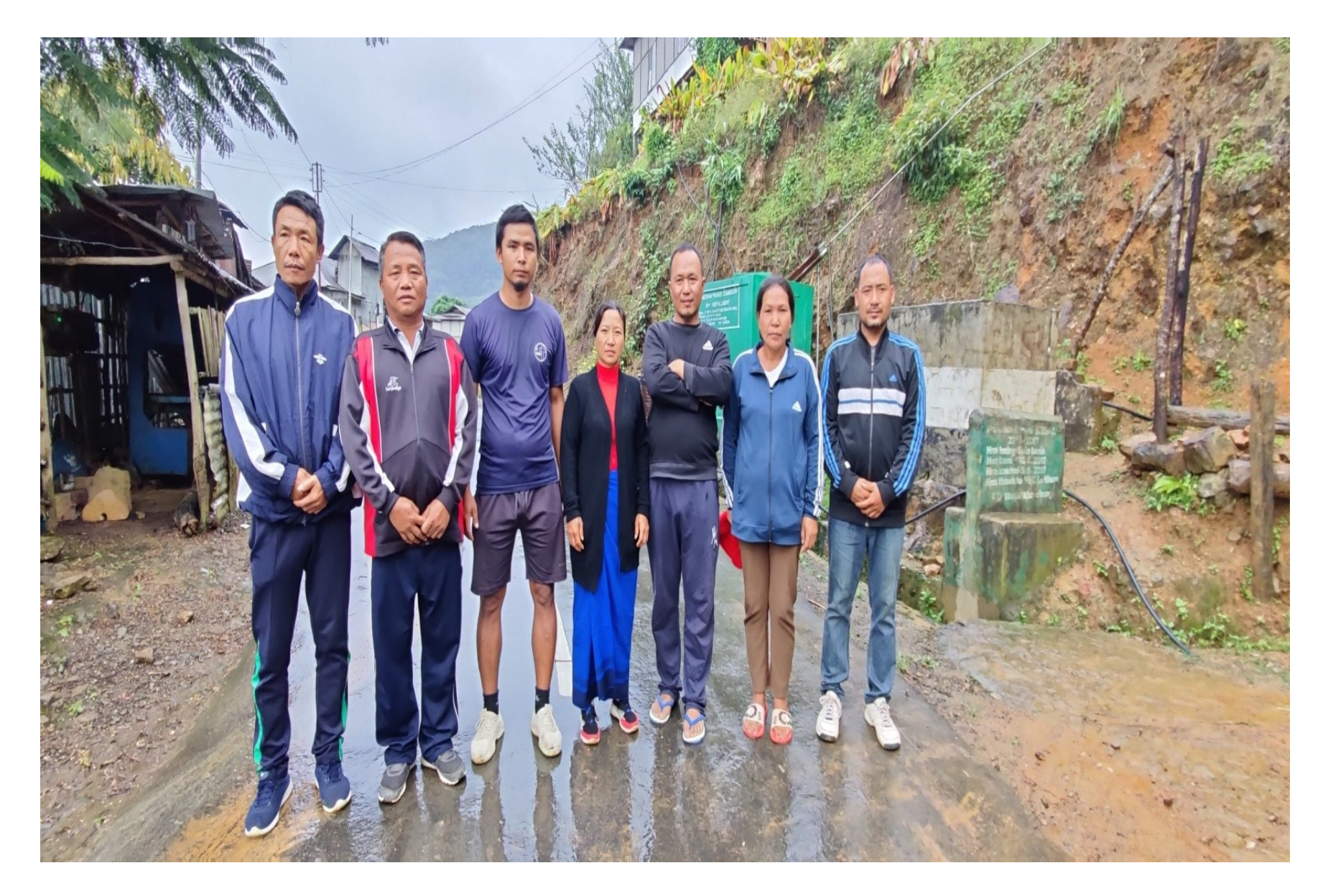
Members of Biodiversity Management Committee, Leithum