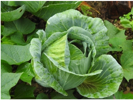
Brassica oleracea var. capitata