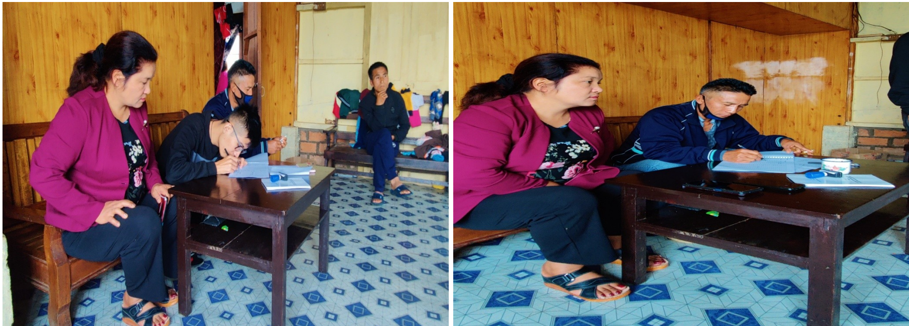
Documentation of PBR – Filling up PBR Formats by BMC Members & SBB staff