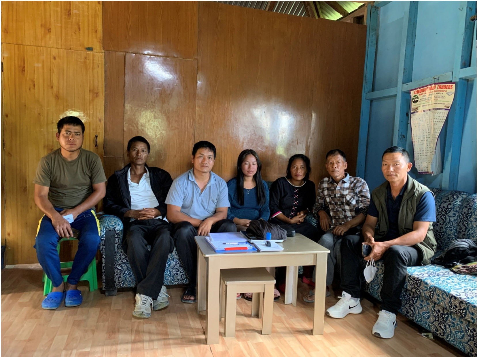
Members of Biodiversity Management Committee, Sazep