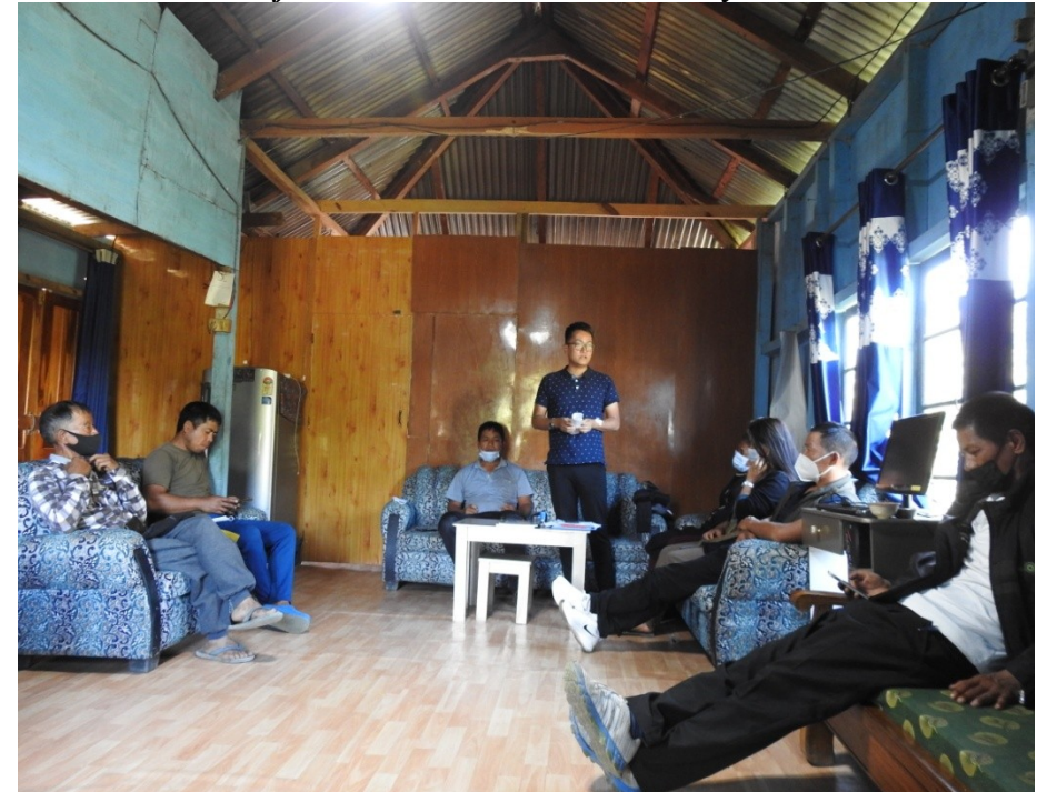
Meeting with BMC Members of Sazep Village