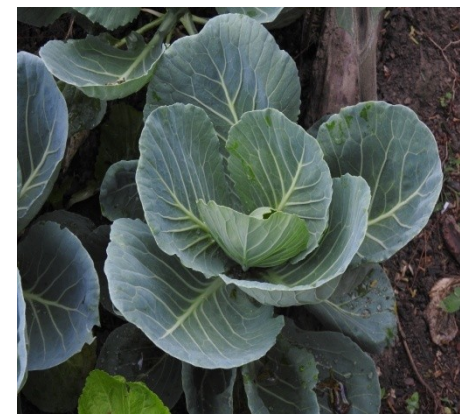
Brassica oleracea var. capitata