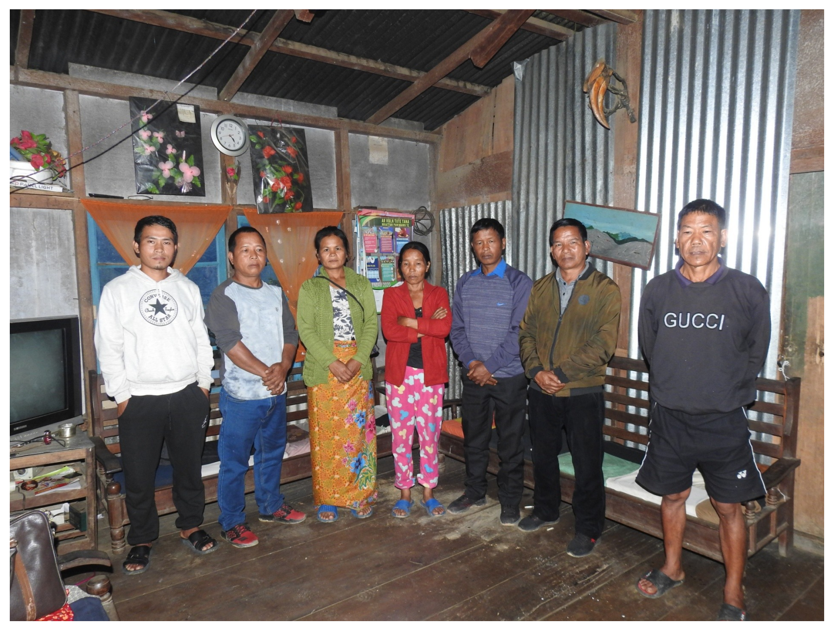
Members of Biodiversity Management Committee, Thekpui