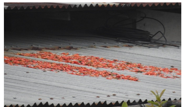
Sun drying of Red Chilli