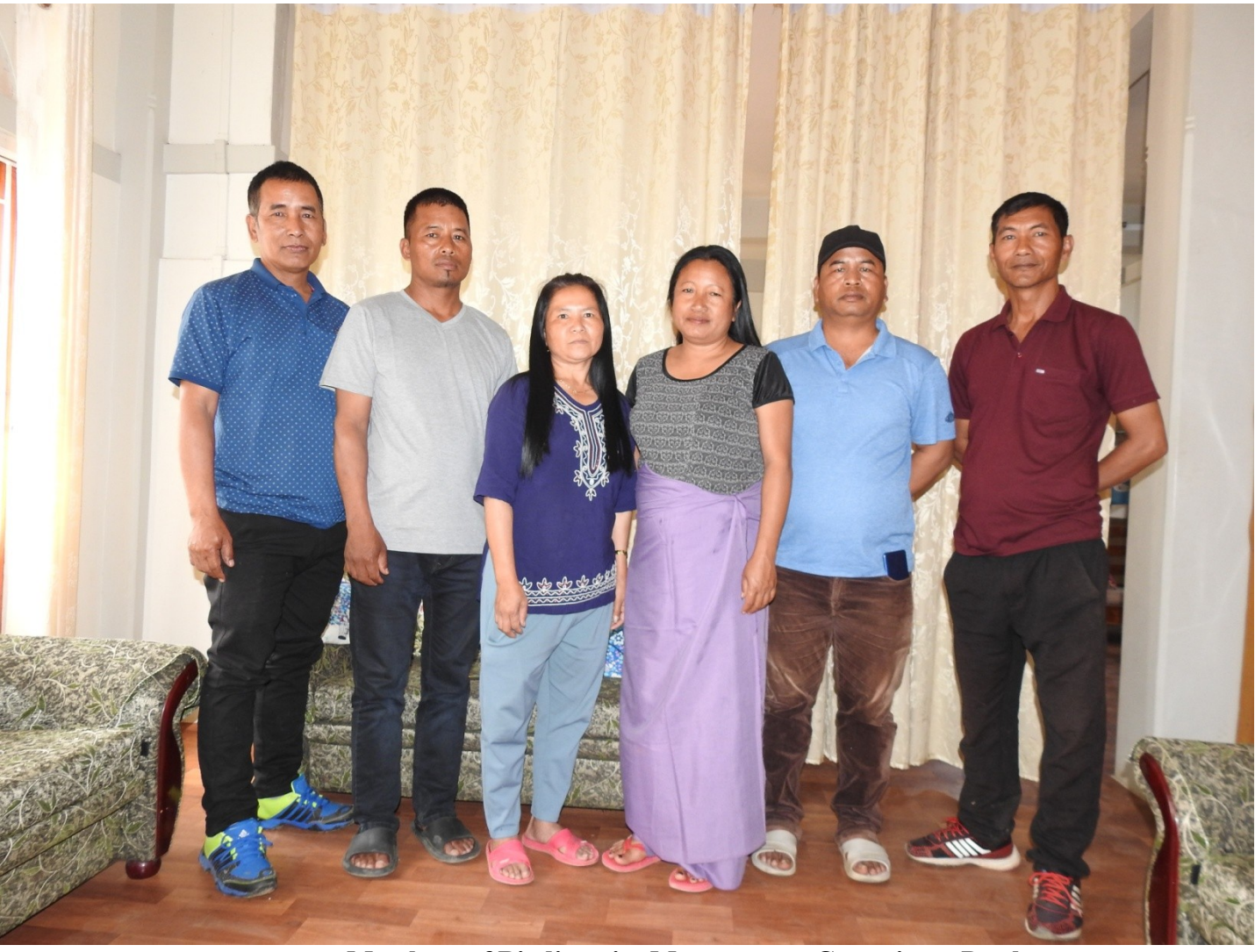
Members of Biodiversity Management Committee, Pawlrang