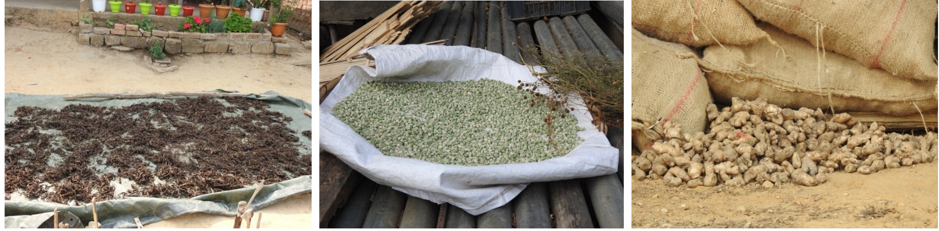
Sun drying of Tobacco leaves