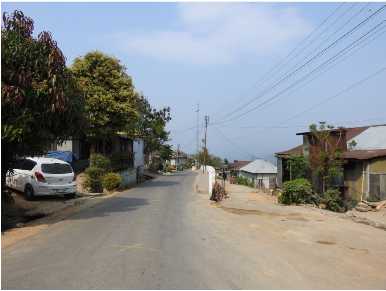
Street of Pawlrang Village