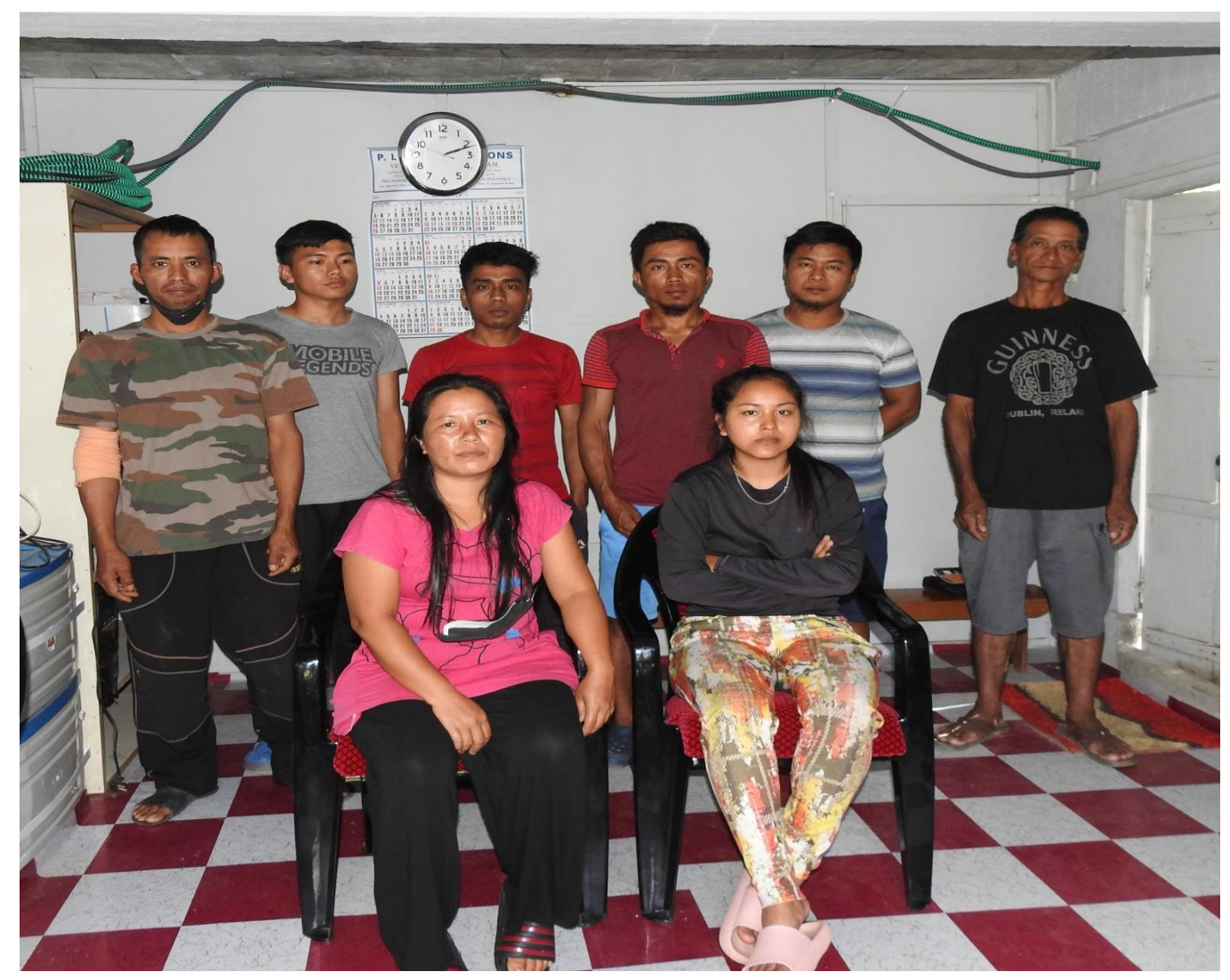
Biodiversity Management Committee Members, Hmuntlang