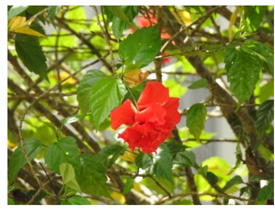
Hibiscus rosa sinensis