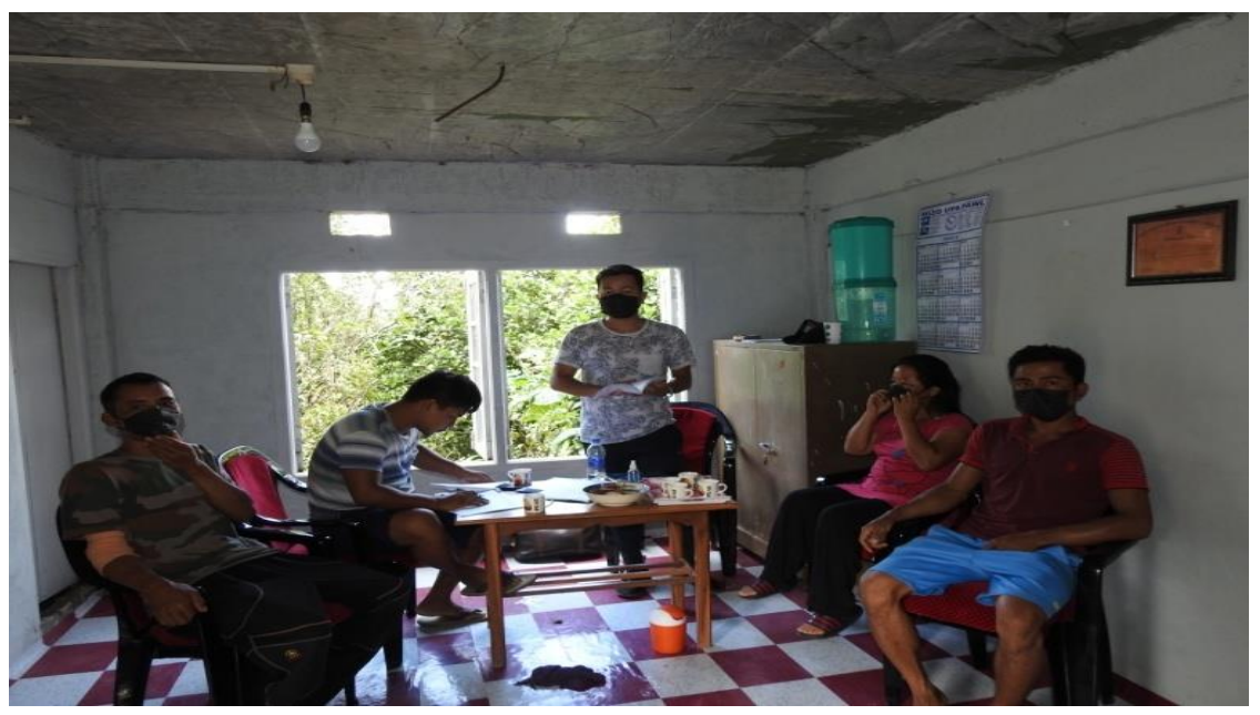
Meeting with BMC members