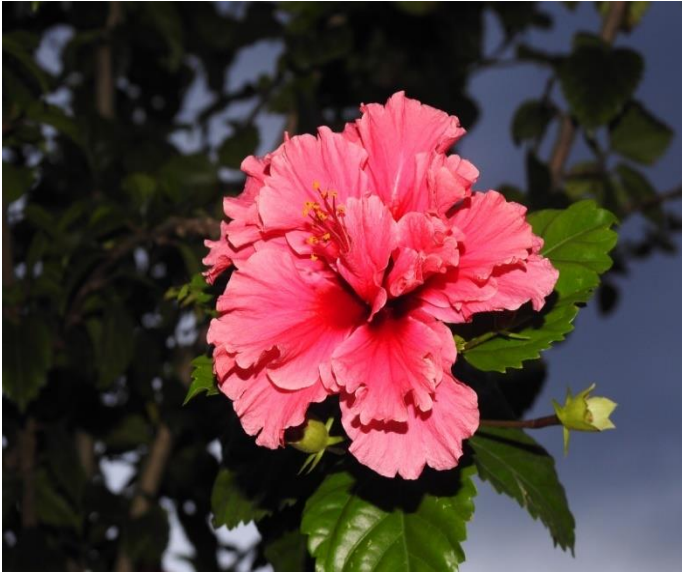
Hibiscus rosa sinensis