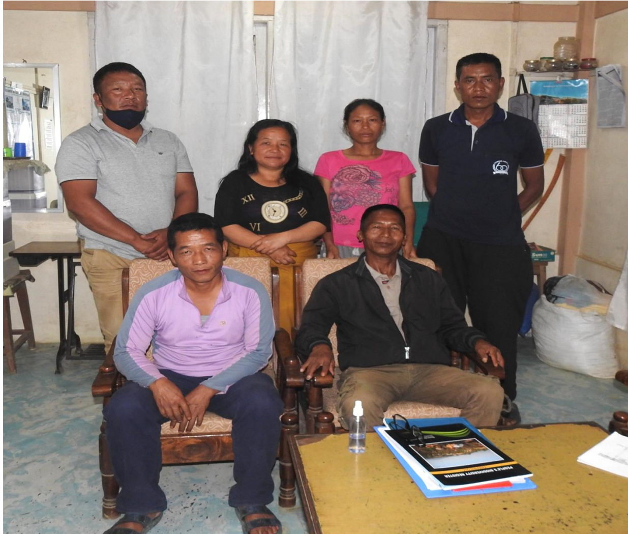
Members of Biodiversity Management Committee, Thingsai