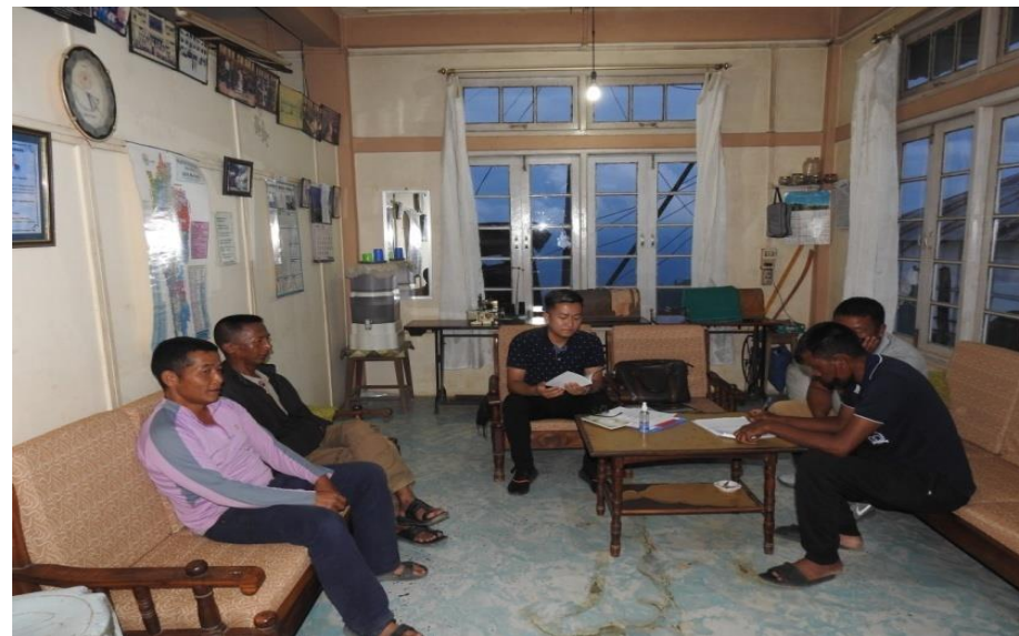
Meeting with members of BMC Thingsai and collecting information and necessary data for updation of PBR