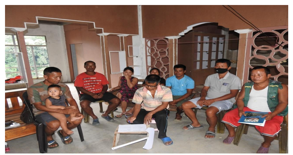
Meeting with BMC Members