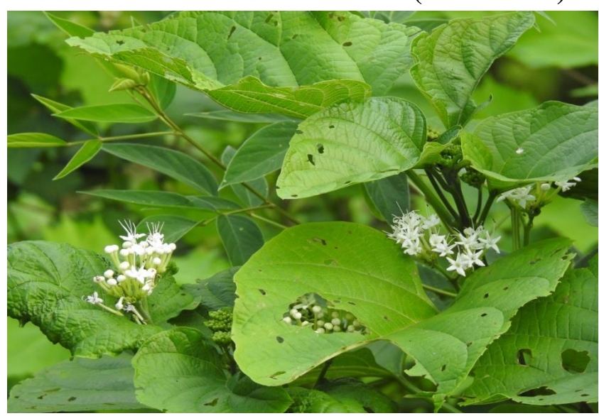
Mentha arvensis (Mint)