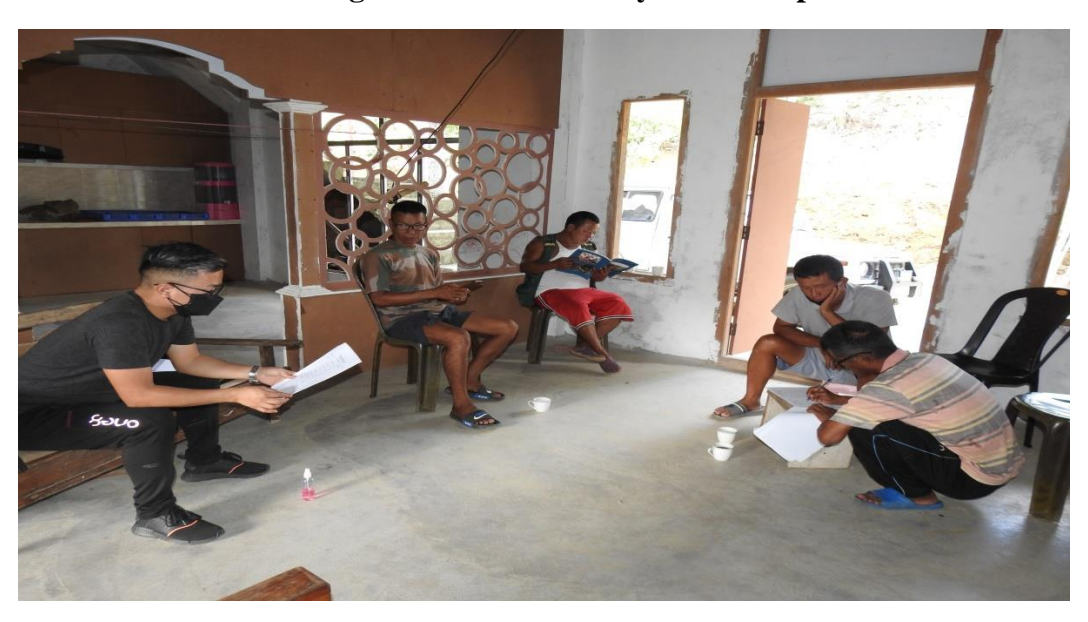
Members of Biodiversity Management Committee Tuipui 'D'